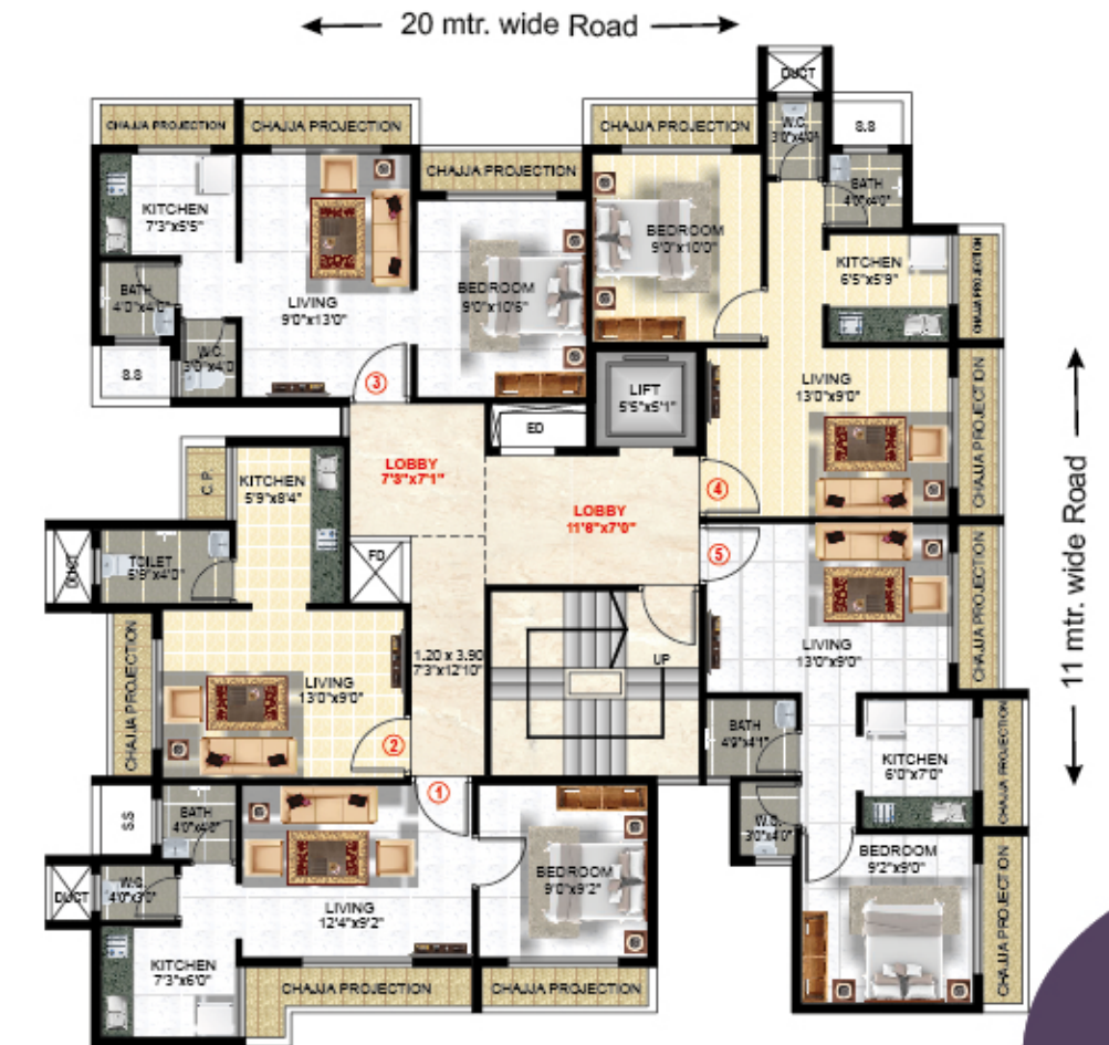
TYPICAL 2ND TO 6TH FLOOR PLAN